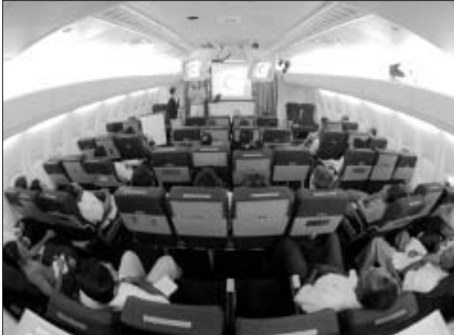
(E) Not an in-flight movie, but live video feed from surgery. Two way audio facilitates give and take between the visiting and local physicians. During surgery room turnover time, this area is used for lectures.