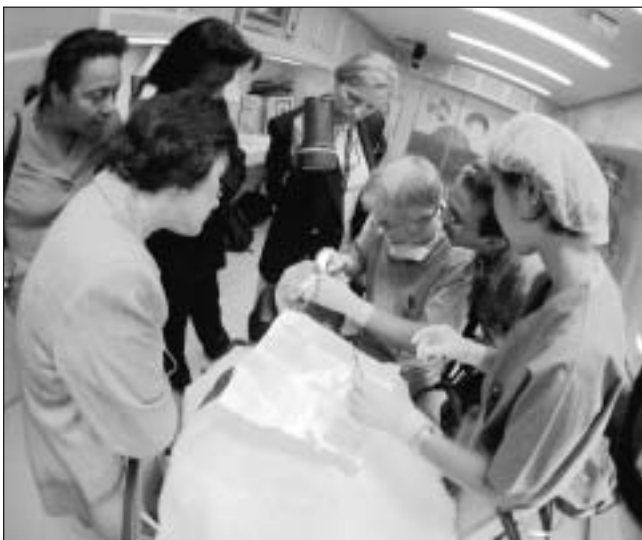
(I) Dr. Black demonstrates an adjustable suture procedure as it would be performed without the benefit of the plane's high tech OR.