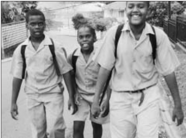
(G) The tradition of school uniforms, photographed on a walk through a middle class neighborhood, is the result of British influence.