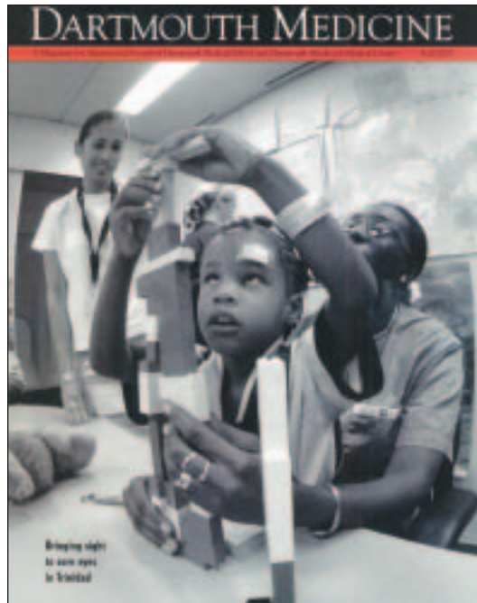
Figure 2: Cover of the Dartmouth Medicine Magazine in which the article 'A Sight for Sore Eyes' appeared. 8

The first, and most important, tool to prepare is your