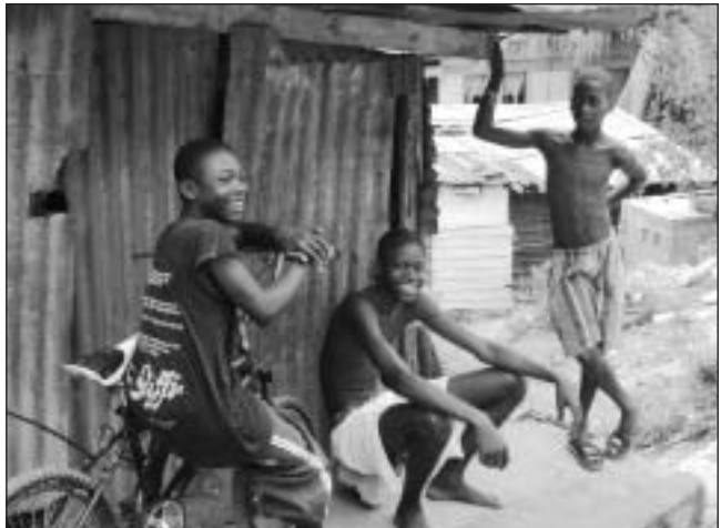
(H) As in many other countries, not all children have the opportunity to attend school.