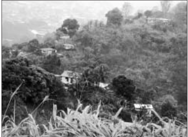
(F) The countryside of Trinidad is lush and tropical: full of mango trees, banana plants and coconut groves.